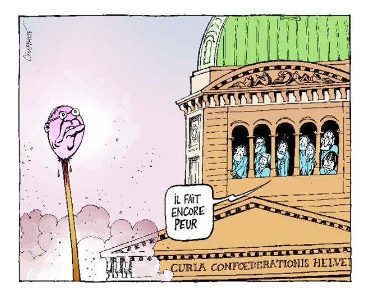
<u>Figure 7:</u> Christoph Blocher's eviction as Federal Counselor, on December 12, 2007, is a collective restaging penalizing disrespect of the rules of family corporatism. ( "He still looks terrifying" — Drawing by Patrick Chappatte, Le Temps , 12/13/07)

Complexities of the Swiss family problematic are thus once again corroborated. The enfant terrible of Swiss politics, who was given the position of an aggressive whistle blower to give value to our devotion to compromise, is now sacrificed on the altar of national concordance by a prescriptive political elite symbolizing the parental figure ( fig. 7). As in his family, beyond fulfillment of the role he was assigned to, Christoph Blocher faces a violent eviction from the government as a punishment penalizing disrespect of the rules of corporatism. It is the replay, at the highest State level, of the denial inflicted on the child's spontaneous expression who, in desperate need of attention, ends up craving the despotic power imposed by adults. But even brutally pushed aside, the populist speechmaker continues to provoke fear because he could soon direct popular discontent and shake the foundations of our political institutions. As of today, any attempt to adapt these obsolete structures to the necessities of a constantly changing world have bumped into the Swiss compliance to group consent by which we handle our historical and personal sufferings.