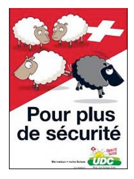
<u>Figure 6:</u> The Swiss People's Party anti-foreigner agenda is a collective restaging of the insecurity endured by children whose natural needs are routinely despised for sake of subordination to group consent. ( "For more safety" – SVP/UDC political poster of Federal elections, 10/21/07)

The emergence of collective repressed sufferings on the Swiss social scene is singularly visible in SVP/UDC political campaigns against insecurity or foreign immigration. During the 1999 federal election, one SVP/UDC poster likened asylum refugees to criminals breaking into the country through laceration of the Swiss national flag, suggesting they should be guarded against as well as of AIDS (43). The 2007 SVP/UDC election campaign was illustrated with a picture representing three white sheep kicking a black one out of the Swiss boundaries, with this comment: "For more safety" (fig. 6). In the meantime, notably because of Christoph Blocher's efforts as Federal Counselor since January 2004, measures against immigration have considerably tightened.