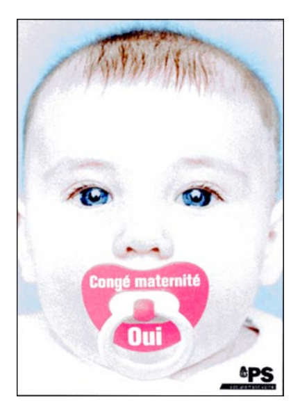
Figure 5: In 2004, Swiss political circles proved disdainful of the child's natural needs in haggling over new maternal leave project. ("Maternal leave: Yes!" Political poster, 09/26/04)

natural need for maternal bonding. In the view of economic decision-makers, it ought to " still expand the contribution of women to the working force " ( L'Hebdo , 08/26/04) in order to guarantee the country's economic growth and funding of social institutions. From this profit driven vantage point, the maternal leave should encourage reluctant mothers to separate from their baby and go back to work, 41 percent of women currently renouncing to their job after their first pregnancy and 60 percent after the second. In Geneva, free-market advocates have made it clear that the Genevan law comprising a sixteen-week paid leave for mothers should lower to meet the new national standard ( Le Courrier , 09/27/04). Such wait-and-see politics, biased by an unconscious sense of revenge, inflict martyrdom to newborn babies who endure unbearable stress and pay the price for the collective short-sightedness ( fig. 5 ).