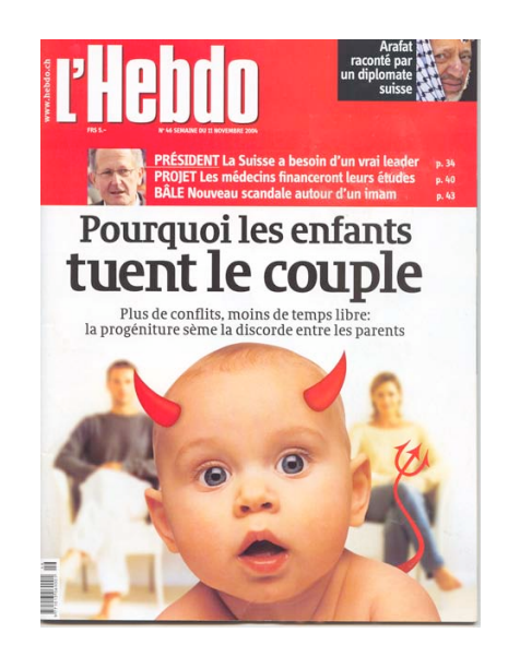
<u>Figure 3</u>: Adults tend to hold their child responsible for their own problems because the child's nature is perceived as "demoniac". — "Why children kill couples. More conflicts, less spare time: progeny causes dissension between parents." (Front page of Swiss magazine L'Hebdo, 11/11/04)

A cover of the Swiss weekly L'Hebdo (fig. 3) recently showed the eye-catching picture of a toddler with a devil's horns and tail, pasted between its genitors, with this allegation: "Why children kill couples." Inside the magazine, a four-page article detailed the "wedded nightmare" supposedly brought by the arrival of a first child. According to a family therapist, the newborn "is the partners' worst enemy". Some academic studies mentioned by the authors claim that the child might drive its parents to breakup and that it is responsible for a degenerating process measured in four "weakening class-marks" (15). We can assume that the all too real marital problems L'Hebdo is referring to are not a child's fault but originate instead in the parents' inability to question their own childrearing so as to be able to fully meet their newborn's natural needs. Unwilling to do so, they tend to view the needing child as a demanding parental figure—the commonly named "domestic tyrant"—whom they will experience as victims. Such state of mind will bring about the restaging of comparable circumstances in which their own needs were despised when they themselves were children.