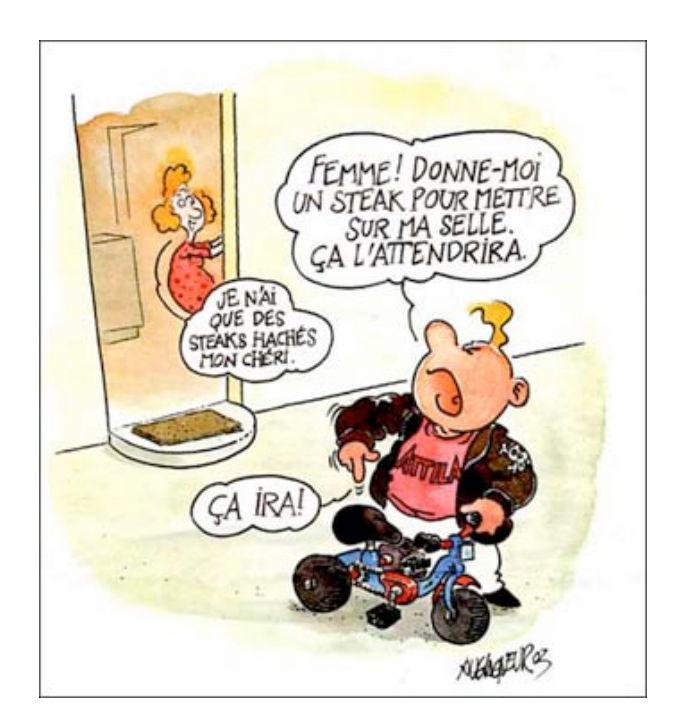
Figure 1: Adults project onto the child the patterns of behavior their own parents showed towards them, thus justifying to reproduce on him/her the violence and contempt they suffered themselves. — "Woman! Give me a steak to put on my saddle. It'll make it tender." "I only have ground beef, dear." "It will do!" — (Construire No 5, 01/28/03)

A few years back, a columnist from Geneva wrote on that account: "Children whom are never told a 'no' always end up bullying their parents, turning their mother into a 'mat mommy' they can always wipe their feet on and pour out whatever they want. And the later you wait, the harder it gets." Here the author doesn't make any difference between refusing to fulfill essential needs, such as breast-feeding, and withholding an object of gratification for instance, which is meant to compensate for the frustration of early essential needs. In an article dedicated to "parental dismissal", he explains a various number of adolescent symptoms as the outcome of a lack of "frustration" in childrearing: "feeding disorders, depressions and suicide attempts, addictions and defiant misbehavior, and also anxieties, feelings of inner vacuity, inferiority or inhibition..." (5) With such state of mind, adults refrain from any question that would challenge the core relationship they establish with children and the attitude their own parents had with them (fig. 1).