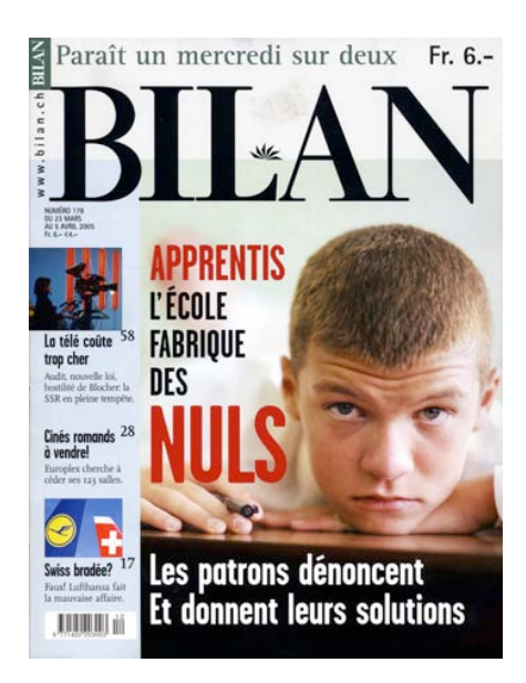
Figure 4: In Switzerland, the psychological violence exerted on children and teenagers is a regular mode of childrearing. ( "Trainees: Schools manufacture DUMMIES; Employers inform and giver their solutions." Front cover of business magazine Bilan No 178, 3/23/05)

statistical rise of cases of mistreatment reported to the Genevan Health Youth Service since the early 1990s. Between 1989-90 and 2002-03, the total number of reported cases multiplied by thirty, going from 12 to 360 cases. That last year, professionals began to take into account a new category called " children at risk ", arising the total number of endangered children to 1,161, almost a hundred times higher than the cases reported in 1989-90 (31). These figures reveal the strong denial that prevailed only a few years back, even among child welfare professionals, on the subject of child abuse alone. They also bring to light what a formidable resistance adults still oppose to the recognition of all forms of abuse against children, particularly the effects of ordinary violence in childrearing such as routine slaps, punishing, humiliations, emotional withdrawal and other means of psychological harassment.