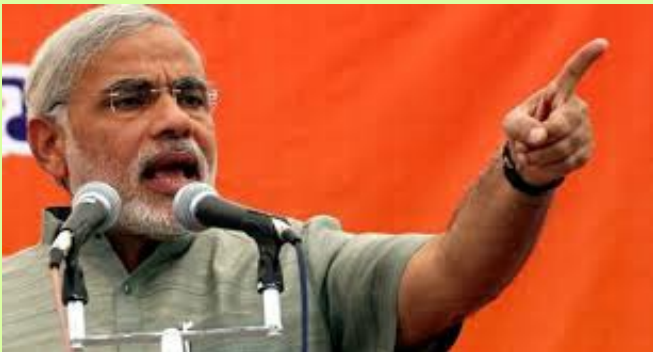
Indian Prime Minister Narendra Modi

India's 2014 parliamentary elections yielded a colossal triumph to nationalist leader Narendra Damodardas Modi. Colloquially referred to as NaMo, Modi won the 2014 Time "Person of the Year" Reader Poll. This was quite a surge of legitimacy for someone widely considered complicit, as Chief Minister of Gujarat, in the 2002 massacre of hundreds of Muslims. Modi's blend of nationalism and neoliberal discourse mobilizes major psychoclasses in Indian politics. With the support of big corporations and the rich, he is beginning to dismantle more than sixty years of progressive social policy instituted under the Nehrus (Jawaharlal, his daughter Indira Gandhi, and her son Rajiv). Whether India is headed into a right wing era or whether progressive leaders will regain power in the coming years remains to be seen, but at the moment it does not look good for the progressive forces.