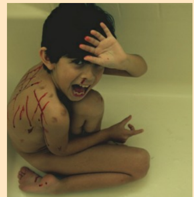
Child abuse is common throughout the world

While we don't have detailed psychobiographies of these young men, we do know that many immigrants like them experience violence frequently from an early age in ghettos and foster care institutions. A community activist told the Internet daily Reporterre that children in these poor neighborhoods are routinely subjected to beatings, electric iron contact burns and sexual assault committed by pedophiles. Close to them at the time, she confided: “I remember those kids whose father was always drunk and fell asleep before they came back from school. He locked the door and the children slept in the stairwells.”(1)