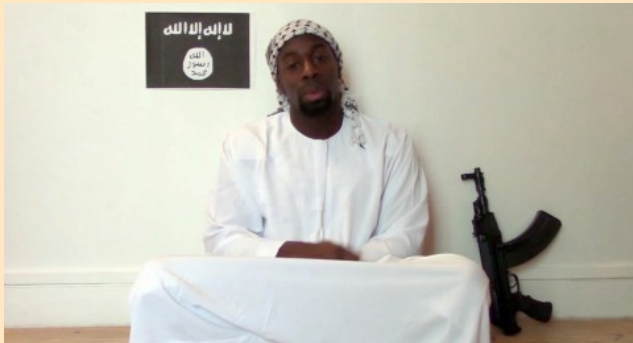
Amedy Coulibaly, who coordinated his attack on a kosher supermarket with the Charlie Hebdo massacre.

As adults, people with such traumatic family histories are at greater risk than the general population for induction into religious fundamentalist “families,” where their abusive parental introjects can be projected onto authoritarian leaders. One such leader was Djamel Beghal, a former member of an Islamic fundamentalist group in Algeria, who played a key role in the radicalization of the Paris murderers. “For me, religion comes first, I don’t give a damn about family” said Coulibaly to Beghal, unaware that the police were monitoring them.(2)