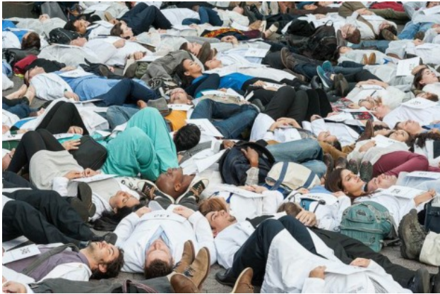
October 29 Die-In in New York City Protesting the Killing of Doctors in Syria