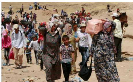
Refugees fleeing war-torn Syria

That said, mass psychology only goes so far in explaining large-scale political violence, which only occurs under special circumstances. In Yugoslavia, for example, there was little political violence until the multi-ethnic communist state collapsed in the 1990s. Similarly, the Arab Spring that began in 2011 has shaken the legitimacy of dictatorships in the Middle East, bringing down regimes in Tunisia, Libya, Egypt, and Yemen.