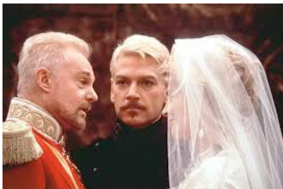
Oedipal conflicts are found in all cultures.

In “The Economic Problem of Masochism” Freud (1924) writes that in “the oedipus complex... [the parent’s] personal significance for the superego recedes into the background’ and ‘the imagos they leave behind... link [to] the influences of teachers and authorities...” (pp. 167–168). Freud (1919a) also refers to this outcome of the oedipus complex in other places: “the father persists in the shape of a teacher or some other person in authority... a substitute taken from the class of fathers” (Freud, 1924b, p. 196, 190; 1910, p. 133). If you understand that any relation of a neophyte to an elder with more authority and skill is a repetition of a childhood model of authority, then you can understand why the phallic-oedipus complex must be universal. There are no cultures in which this “difference between the generations” doesn’t exist.