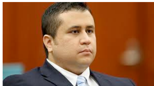
Gunman George Zimmerman, who fatally shot unarmed teenager Trayvon Martin in February 2012

infant will become. Persons whose needs were met in infancy and early childhood will generally feel empowered to meet their own needs in non-destructive ways as adults. Persons who experience love and empathy will in most cases become loving and empathetic. By contrast, a person who was punished for crying as an infant and whose developmental needs were not met will most likely grow up into a troubled adult who will cause suffering to themselves and others. In some cases, this will take the form of violent aggression. This is of course a simplification of how individual personality and motivation develop, but it is the least misleading simplification we know for explaining individual destructiveness.