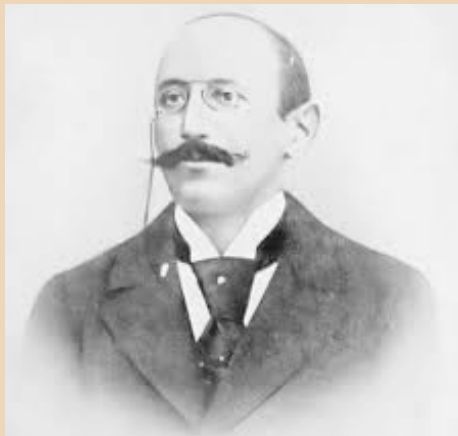
Alfred Dreyfus (1859-1935)