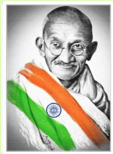
Mohandas K. Gandhi, the Mahatma

an alcoholic arrested on several occasions for public drunkenness and caught in a number of petty crimes including embezzlement. Rather than reflect on his own failures as a father, Gandhi snapped and eventually banished Harilal from the family.